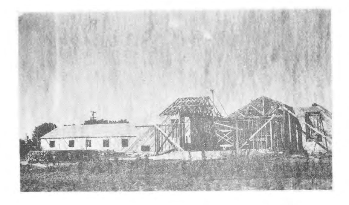
Back view of present chapel in Yuba City, during construction in 1948