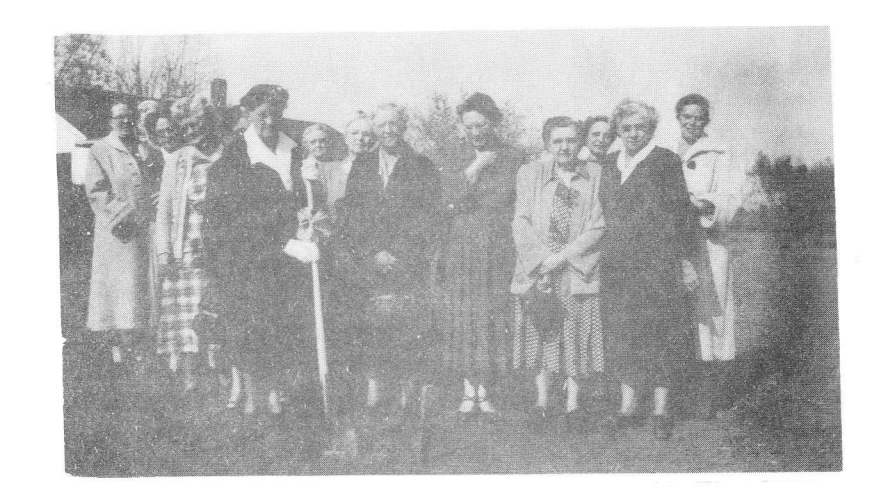
GROUND BREAKING NOVEMBER 9, 1953