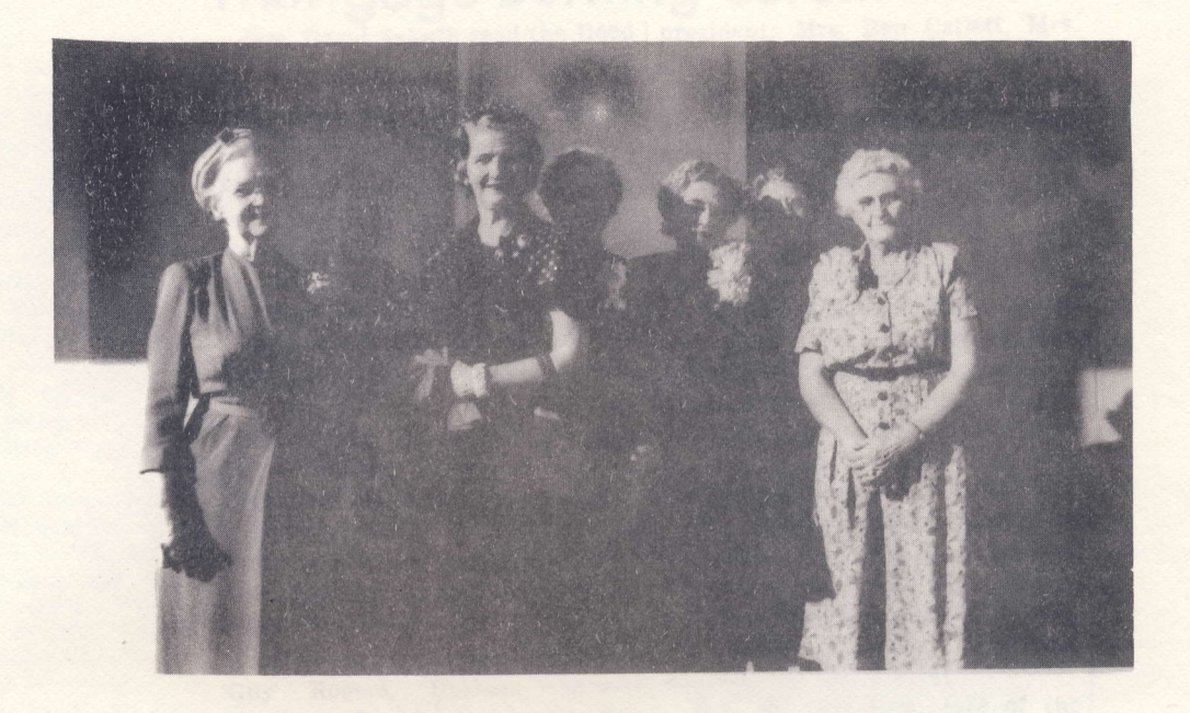
DEDICATION DAY FEBRUARY 28, 1954