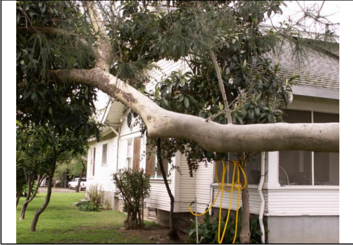
View looking northwest at the south elevation