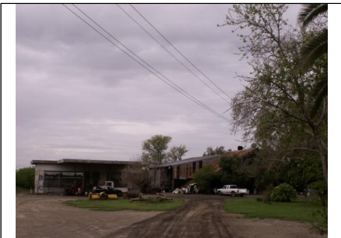
View looking at the ancillary buildings