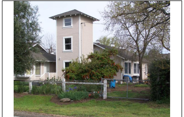
View looking west at the east elevation and tankhouse