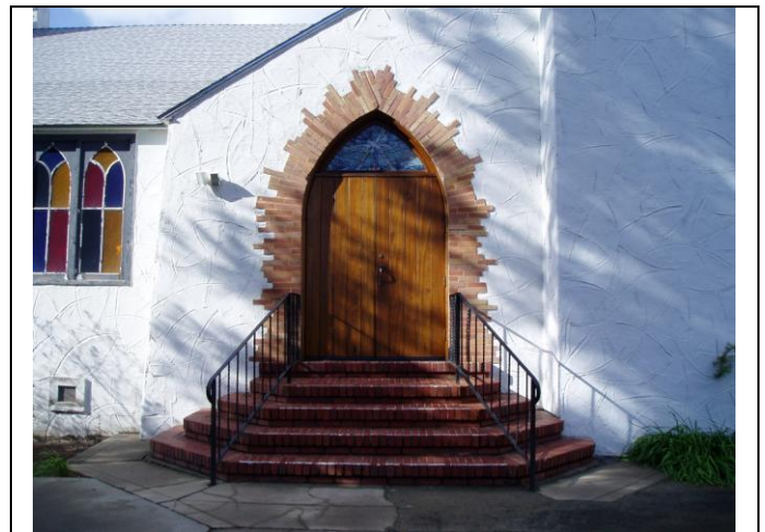
View looking at the façade entry details