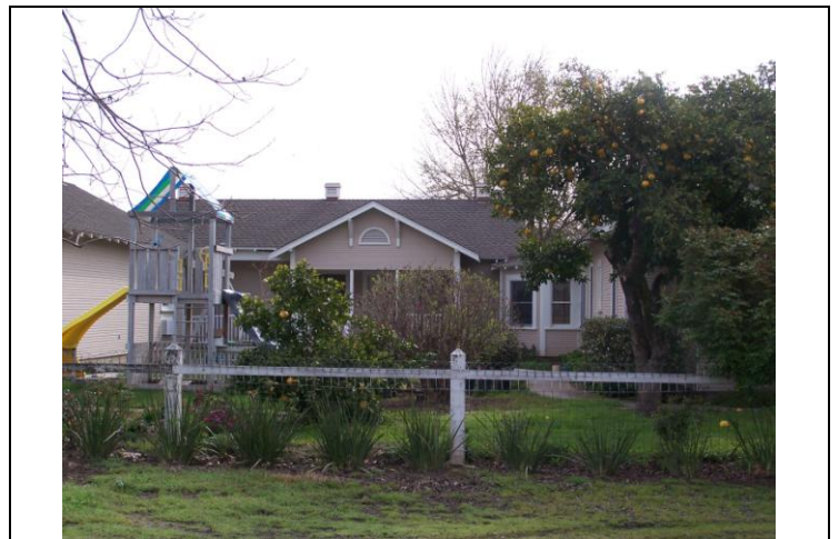
View looking at the west elevation of the addition