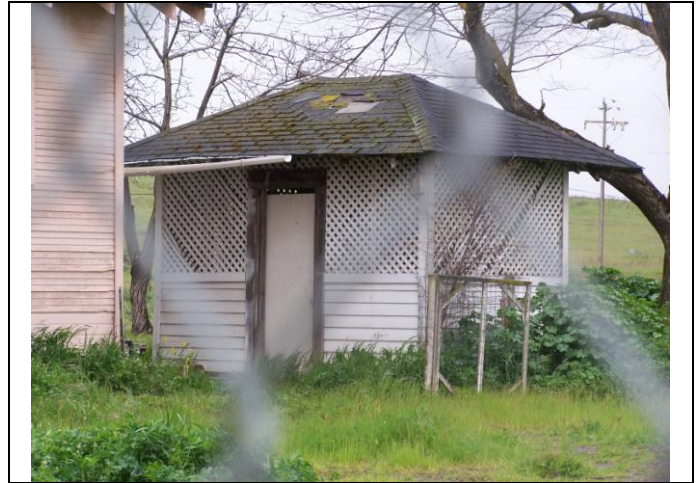
View looking at the shed southwest of the primary building