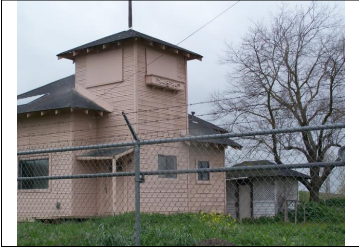
View looking southeast at the west elevation