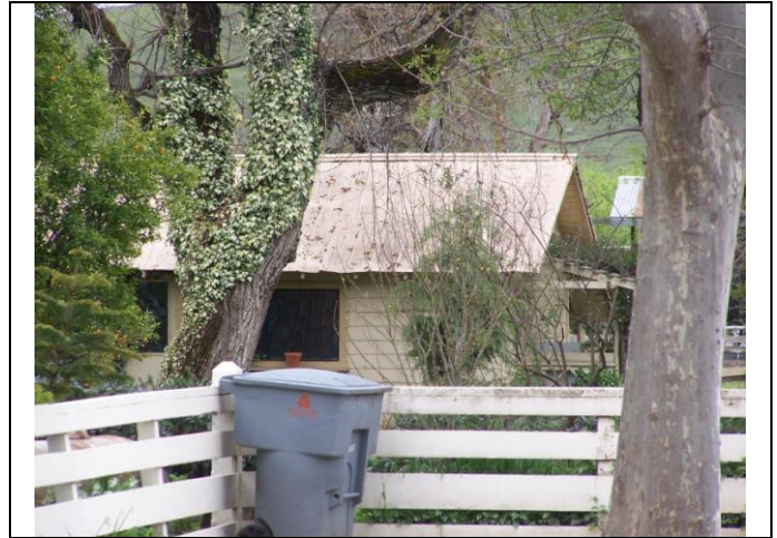
View looking at the second residence on the property