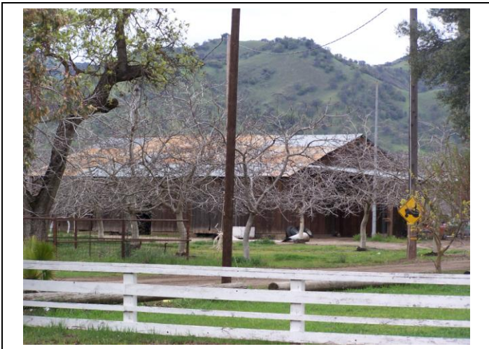
View looking at the barn