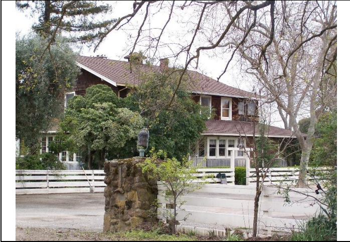
View looking southwest at the east elevation