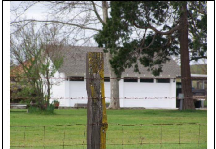
View looking at the garage