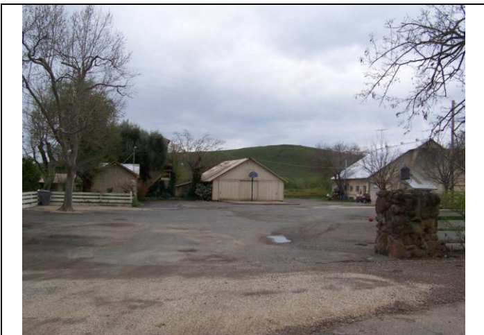
View looking at the ancillary buildings