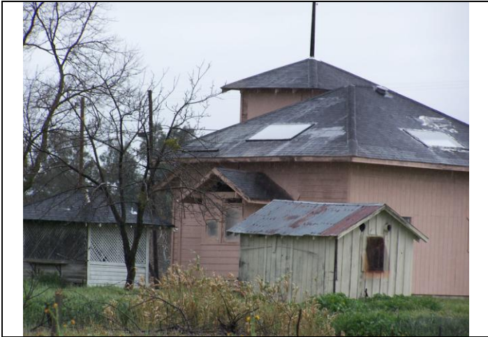
View looking northwest at the south elevation