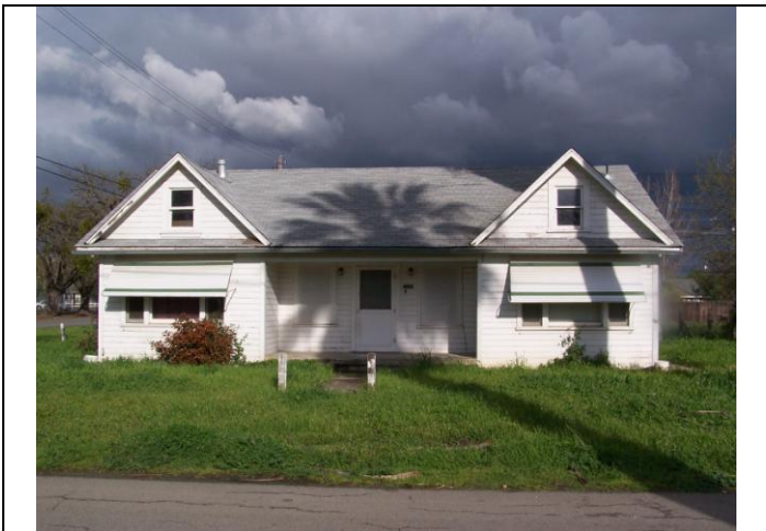
View looking east at the west elevation

Alterations to the building include the second floor dormers, the aluminum awnings and a carport. The condition of the building is fair to poor.