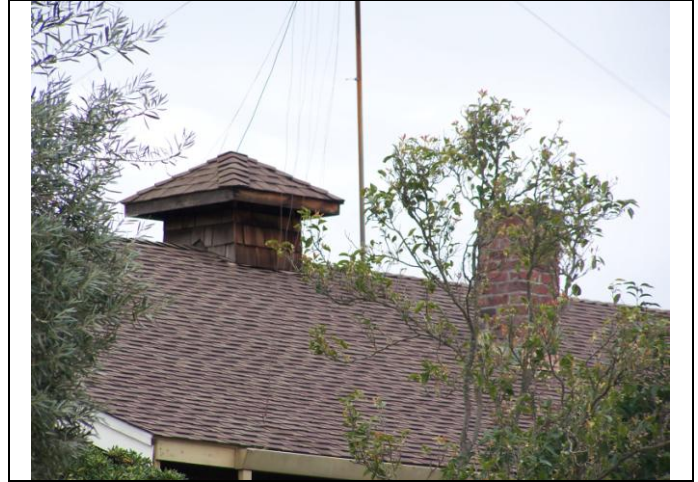
View looking at the roof vent details