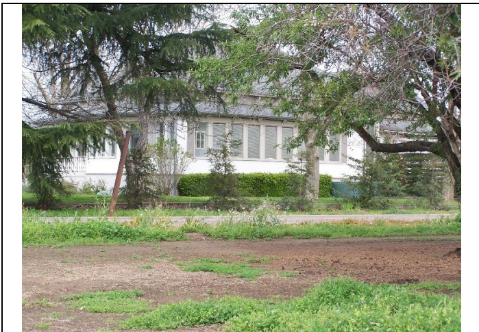
View looking north at the south elevation

Alterations to the building include an enclosed porch and stucco on the house. The condition of the building is good.