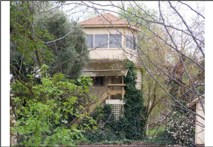
View looking at the tankhouse