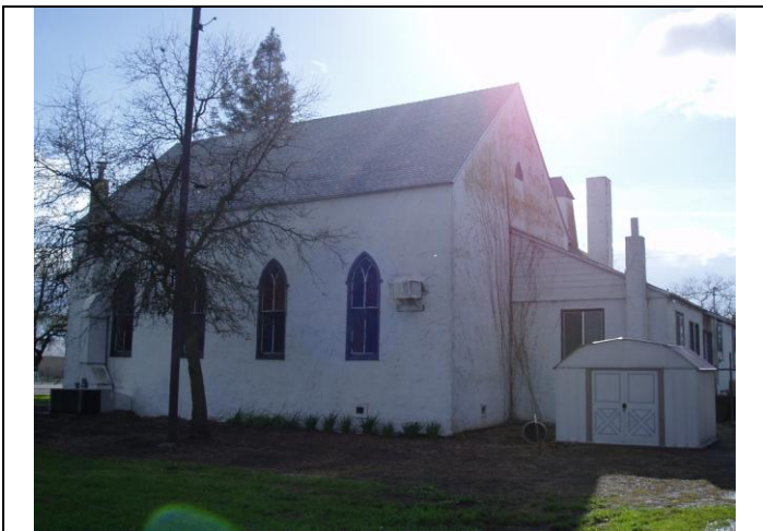
View looking west at the east elevation