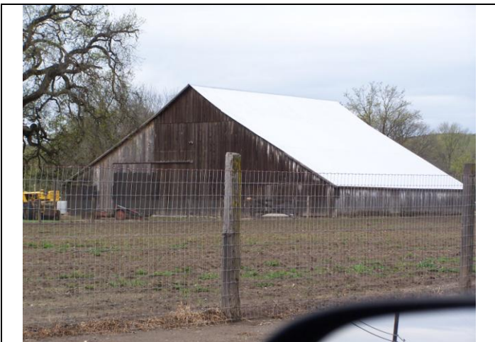
View looking at the barn to the rear of the property