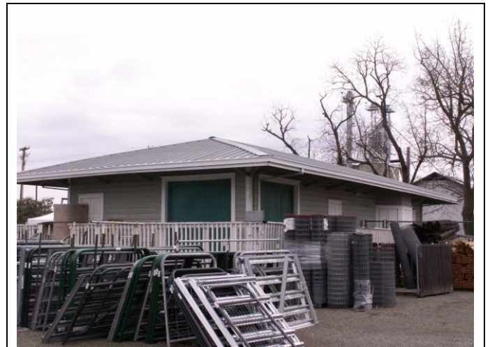
View looking northeast at the west and south elevations