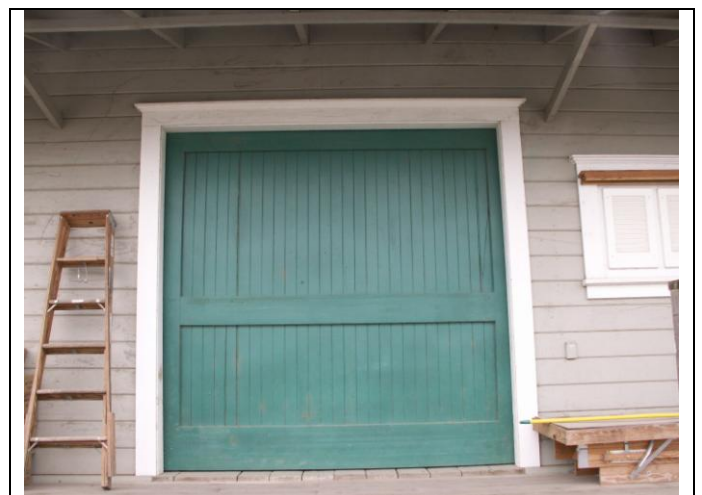
Detailed view looking south at the north elevation