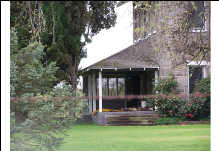
View looking at the porch details