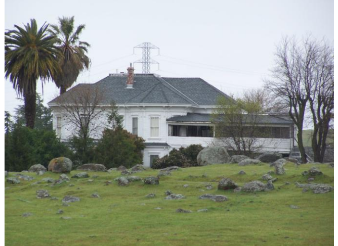
View looking north at the south elevation