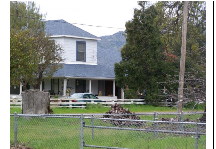
View looking north at the south elevation