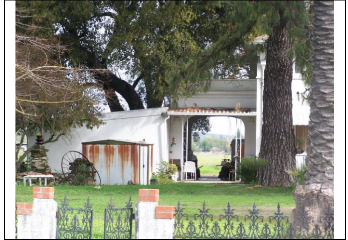
View looking at the carport north side of façade