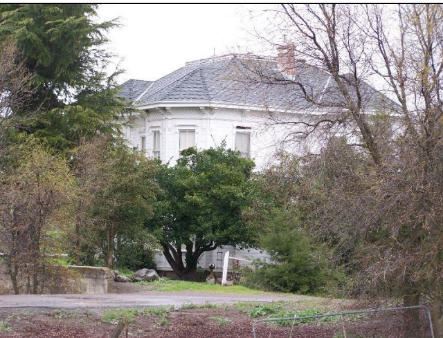
View looking northwest at the south elevation