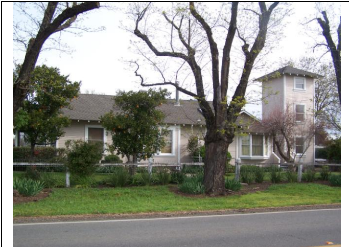
View looking north at the south elevation

Alterations to the building include a modern addition at the west elevation, a bay window, a side house and a garage. The condition of the building is excellent.