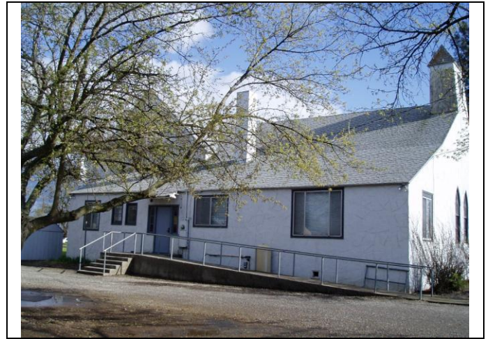
View looking south at the north elevation