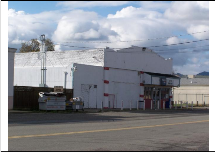
View looking northwest at the south elevation

The condition of the building is fair. Alterations to the building include the addition of the porch.