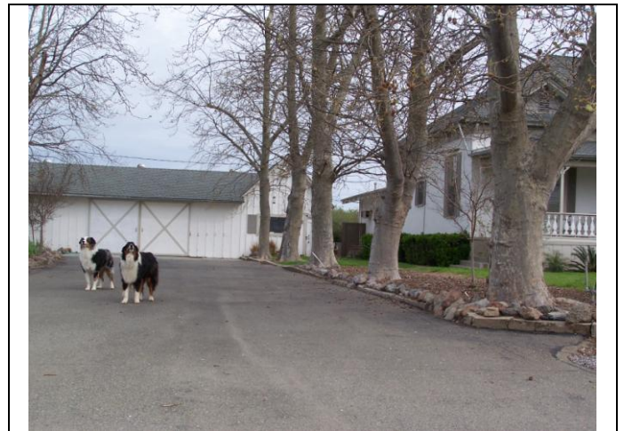
View looking east at the north elevation