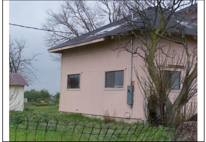
View looking southwest at the east elevation