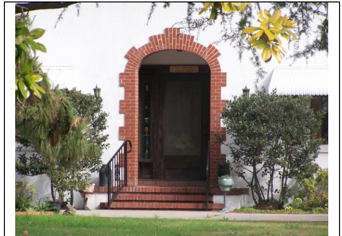
View looking at the façade entry details