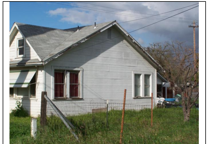
View looking north at the south elevation