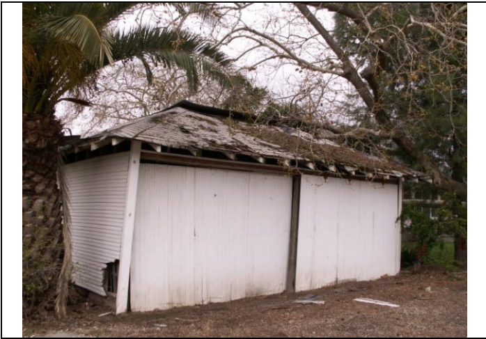
View looking at the garage details