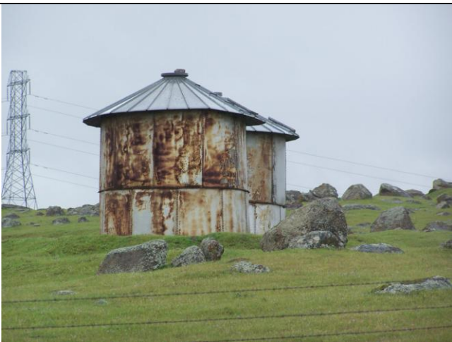
View looking east at silos to the west of the residence