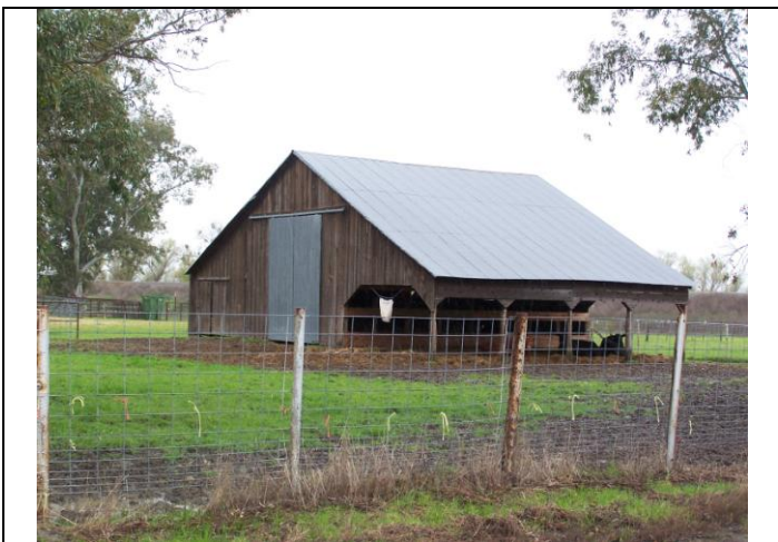
View looking at barn #1