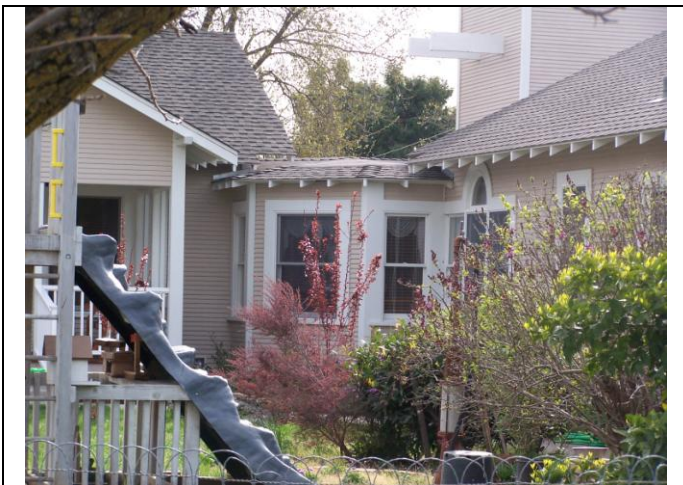
View looking at the elevation details