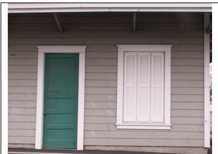
Detailed view looking west at the east elevation