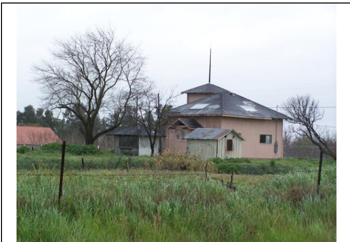
View looking northwest at the property