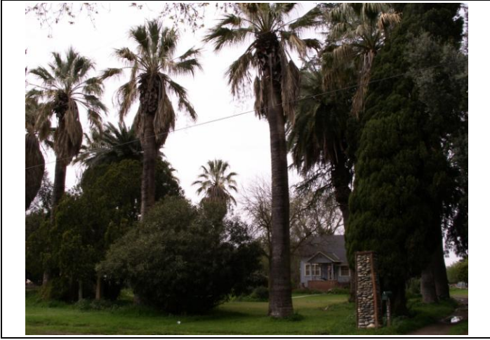
View looking southwest at the façade in context