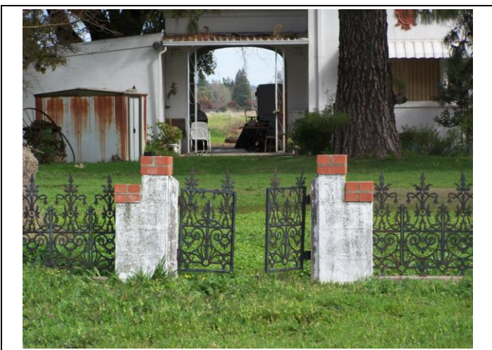
View looking at the gate and fence located at the front entrance