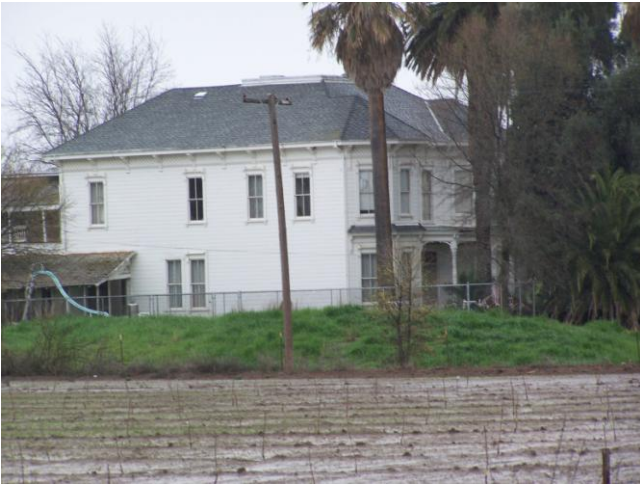
View looking southeast at the north elevation