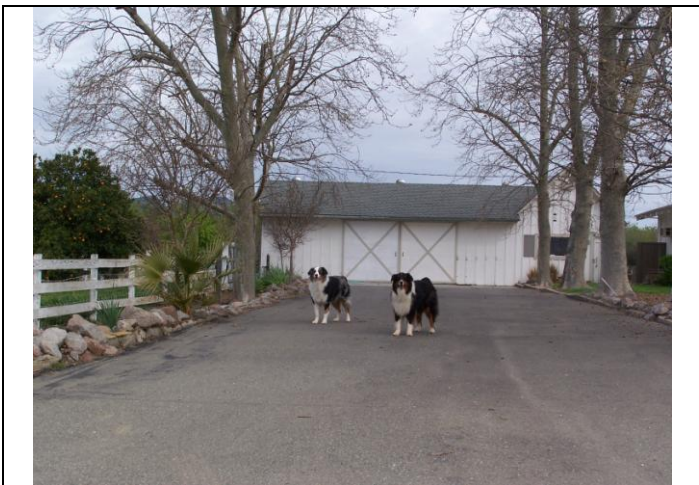
View looking at the west elevation of the garage