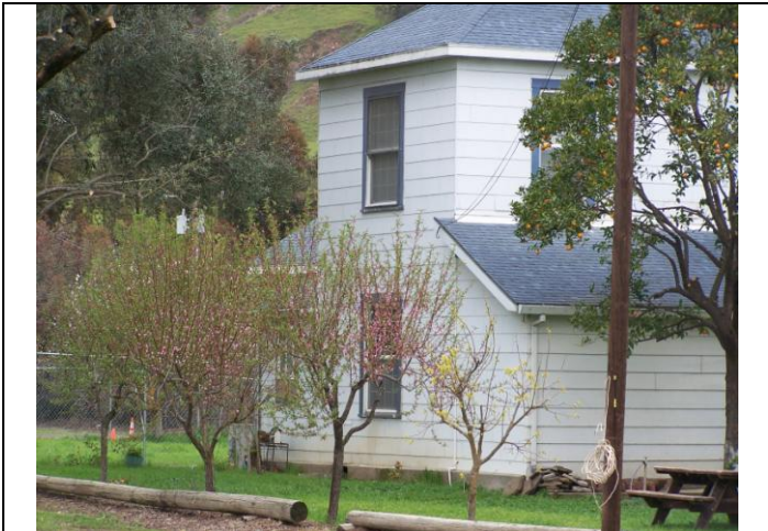
View looking east at the north elevation

Alterations to the building include vinyl siding and windows. The condition of the building is good.