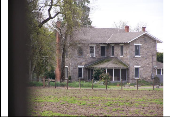
View looking north at the south elevation