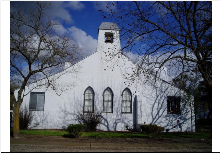
View looking east at the west elevation

Alterations to the building include circa 1960s or 1970s replacement of main entry stair rails and possibly stairs and landing. The shed-roof addition at the rear (north) elevation also contains a wheelchair ramp. The condition of the building is good to fair.