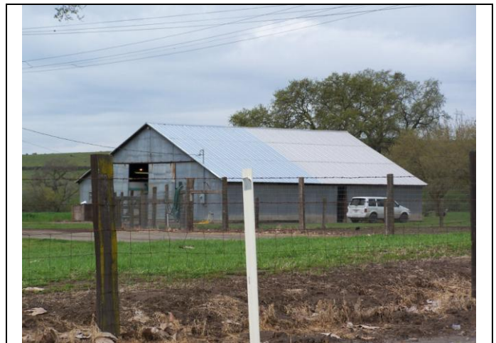
View looking at a second barn located on property