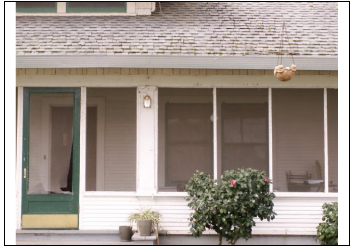
View looking at the façade porch details