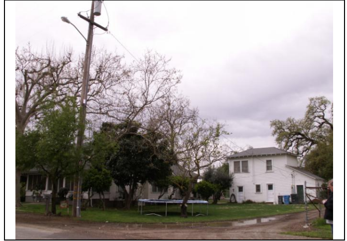
View looking southwest at the east elevation and guest house