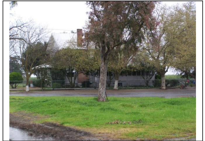
View looking east at the west elevation