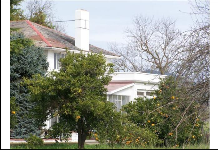
View looking northwest at the east elevation