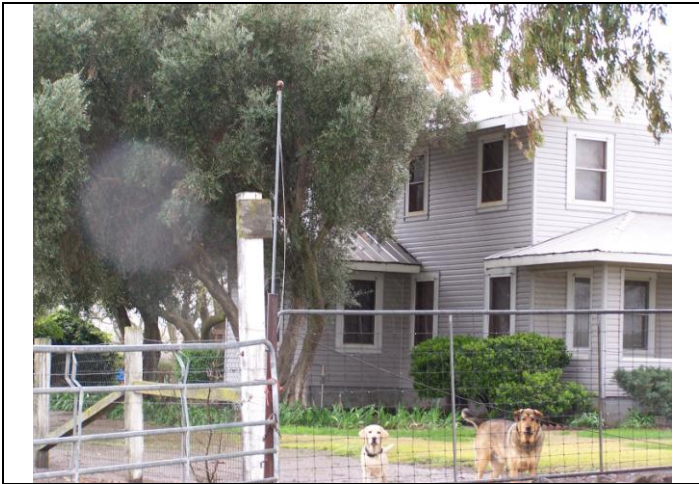
View looking west at the east elevation

Alterations to the building include the screened porch. The condition of the building is good.