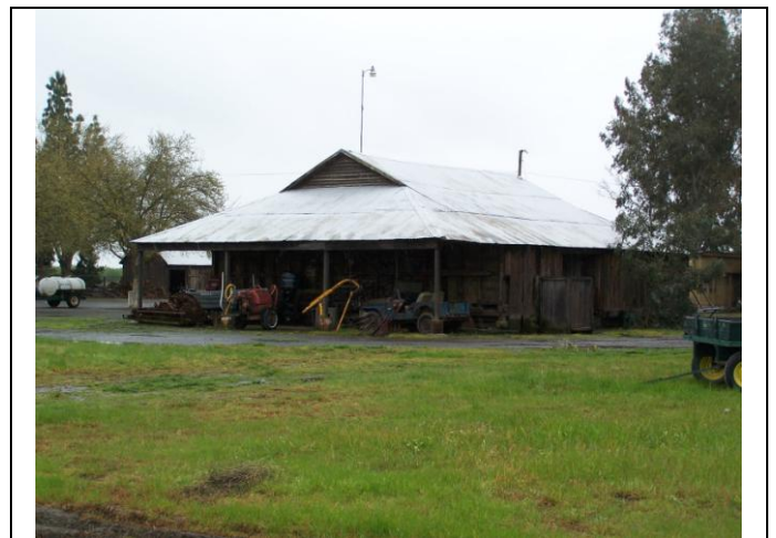
View looking at barn #2