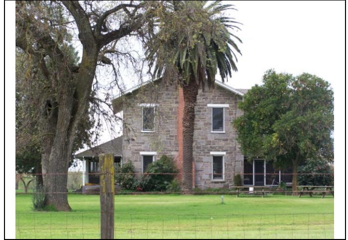
View looking east at the west elevation