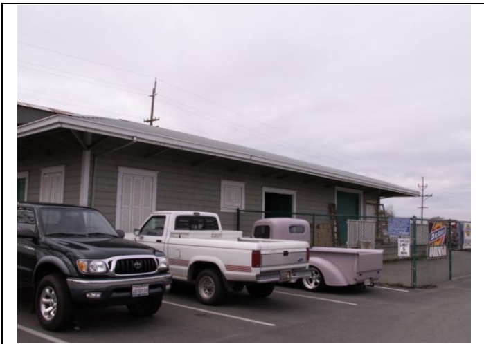
View looking southwest at the north elevation

Work was done to the building exterior in 1997. This included installing new flooring on the loading dock, cutting off the edges of the roofline, replacing the roof material, installing new gutters, laying a new foundation, and paving over the train tracks. The interior remains intact. The building is in good condition.