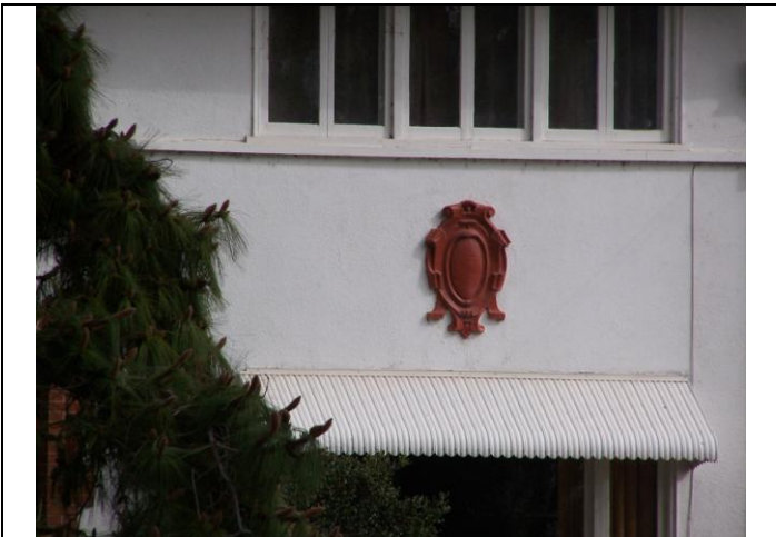
View looking at the cartouche located on the façade