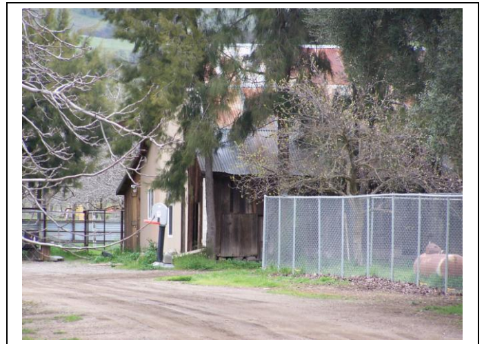
View looking at the shed