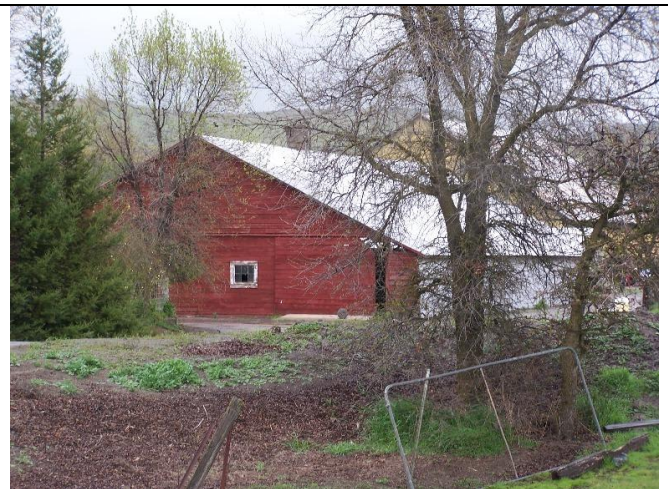
View looking at the barn located southwest of the primary residence